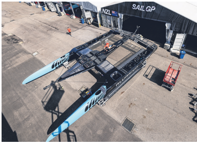
Team New Zealand's F50 Catamaran at the SailGP team technical base ahead of the Singapore Sail Grand Prix.

The F50 is a foiling catamaran, a boat that has two parallel hulls of equal size which gives it more stability.