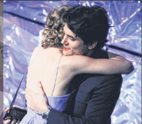
They hug on stage (above) during the Songwriters Hall of Fame induction ceremony in June 2010.

The two are then spotted together on a group date in January 2010. American media reports that the romance ends by February 2010, but they remain on good terms.