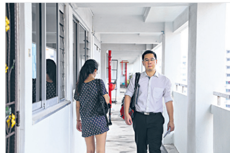
Older HDB block

Completed: 1992 Location: Pasir Ris Corridor width: 1.61m