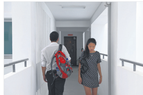
HDB Build-to-Order – Costa Ris

Completed: 2015 Location: Pasir Ris Corridor width: 1.49m