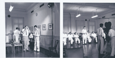
June 10, 1959 Low Yew Kong Film studio Cathy Keris receives a commission to shoot a film at City Hall to introduce the new 1959 Cabinet, including Prime Minister Lee Kuan Yew and eight ministers. The 10-minute film is later screened at all Singapore cinemas.