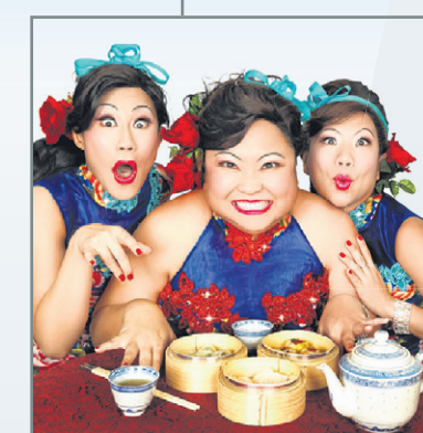
8 DIM SUM DOLLIES Sunset Stage, Sept 20, 6.10 to 6.40pm