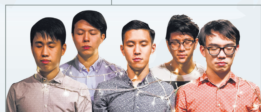
5 TAKE TWO Coyote Stage, Sept 19, 7 to 7.30pm + Sunset Stage (Zone 1) Sept 20, 10 to 10.40pm