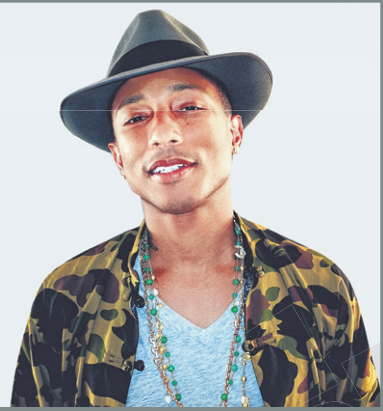
1 PHARRELL WILLIAMS Padang Stage, Sept 18, 11.10pm to 12.30am