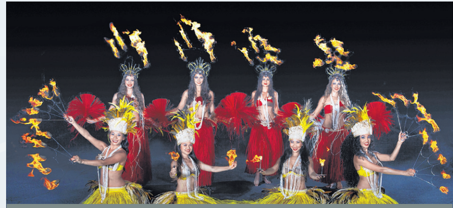
4 THE DANCING FIRE Village Stage, Sept 18, 11 to 11.40pm & Sept 19, 7 to 7.30pm + Paddock Club Lifestyle Stage, Sept 20, 6 to 6.40pm