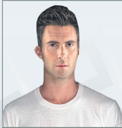
2 MAROON 5 Padang Stage, Sept 19, 11.15pm to 12.30am