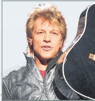
3 BON JOVI Padang Stage, Sept 20, 10.30pm to 12.30am