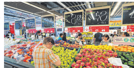
24% Goods and services tax (S$10.2b)