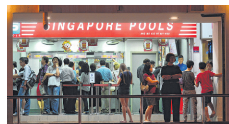
6% Betting tax* (S$2.6b)