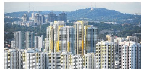
10% Property tax (S$4.3b)