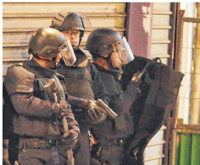
Special forces personnel taking cover during the gunfight with suspected terrorists at an apartment block in Saint-Denis.

11.47am Police say the assault is over and that seven people have been arrested, including two in a neighbouring apartment.