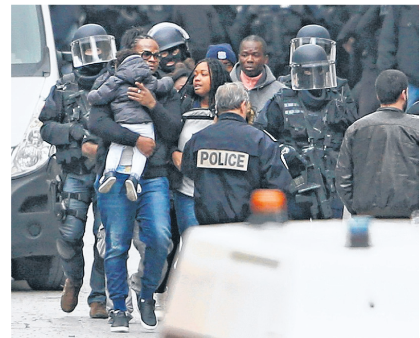
Residents being evacuated from the building where the raid is taking place.