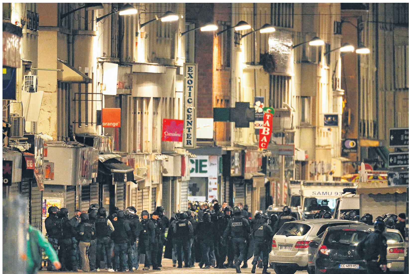
French special police forces securing the area as shots are exchanged in Saint-Denis, near Paris, yesterday during an operation to capture fugitives from the deadly terror attacks in the French capital last Friday.

4.15am Anti-terrorist police raid an apartment in the Paris suburb of Saint-Denis. Shooting breaks out.