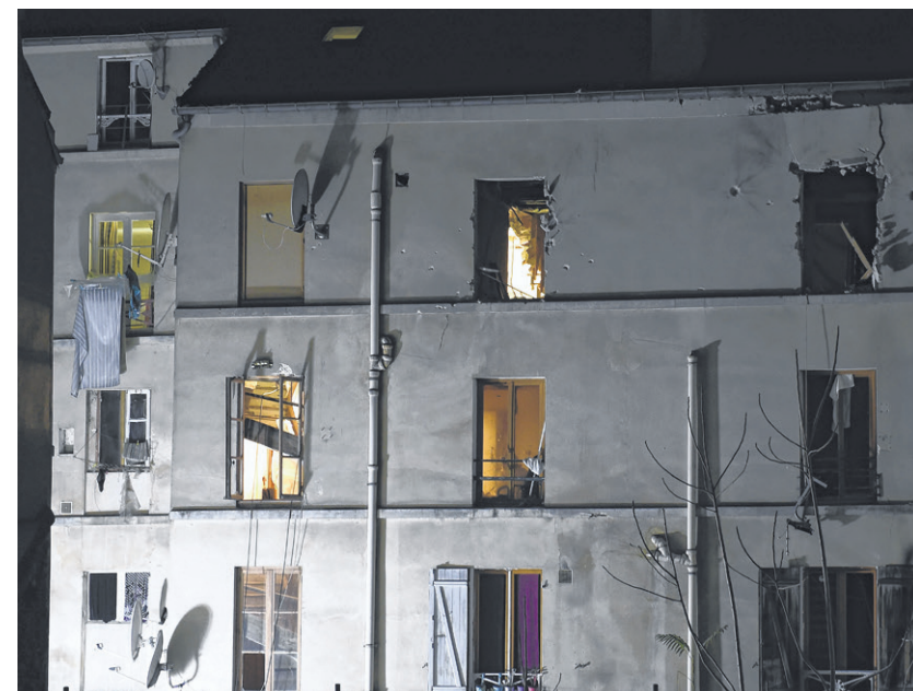
The building where police raided an apartment to hunt those behind last Friday's attacks in Paris.