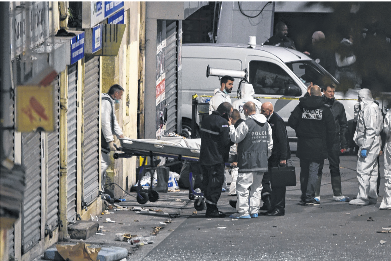
A body being removed from the apartment raided by French police on Wednesday in Saint-Denis.