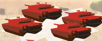
Enemy armour column