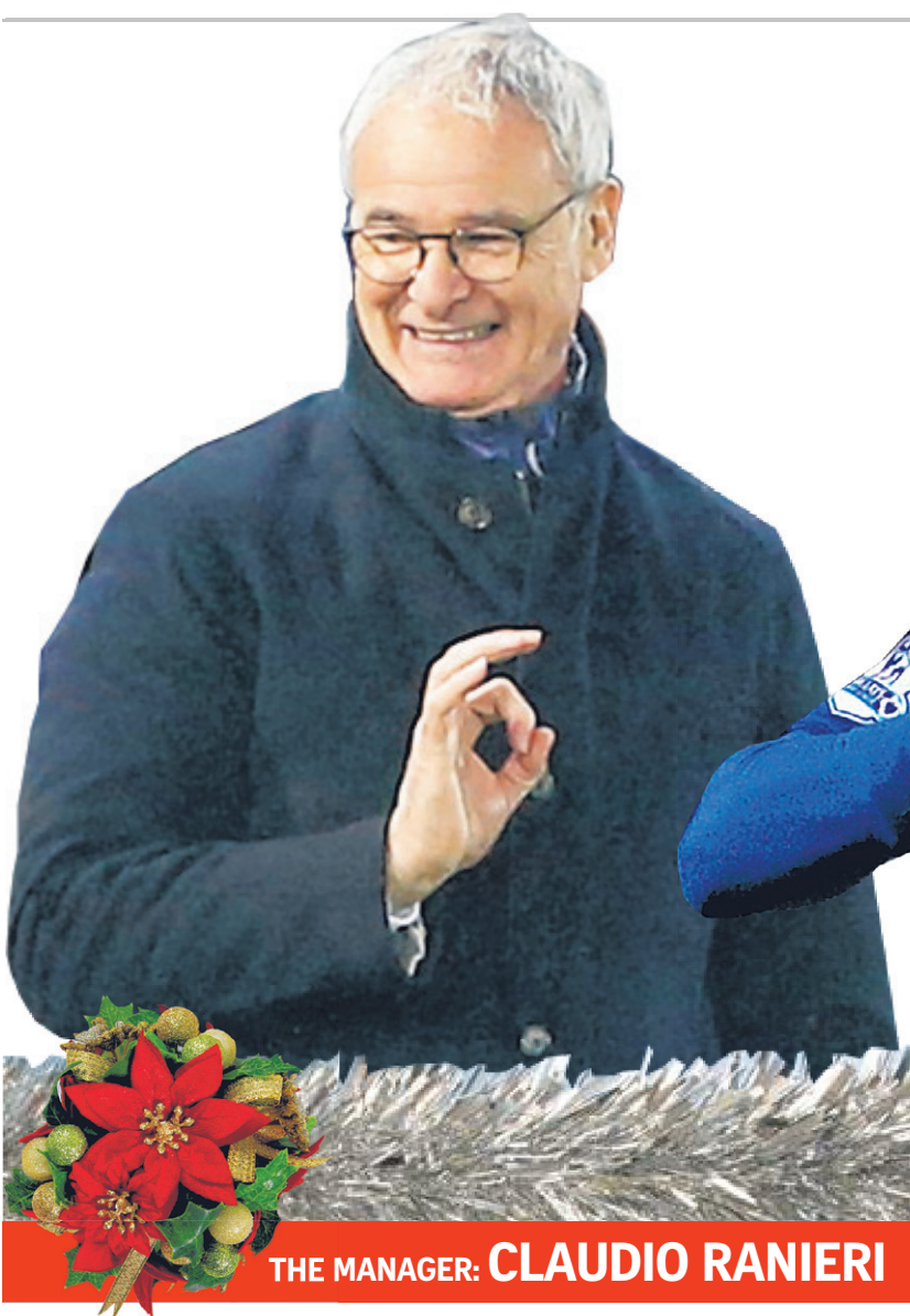
THE MANAGER: CLAUDIO RANIERI

Not many fans could have predicted Leicester City to be at top of the table at Christmas, but Claudio Ranieri and his merry men have somehow defied the odds.