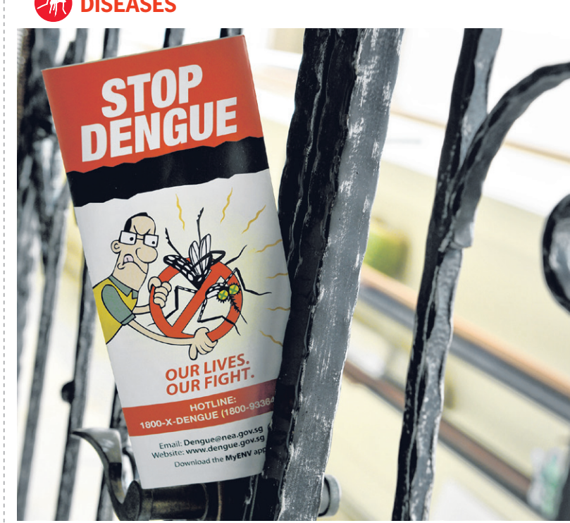
Singapore and the Philippines have warned of an increase in the incidence of mosquito-borne diseases like dengue owing to more conducive climatic conditions brought about by El Nino. In addition, flooding has raised the risk of waterborne diseases in countries like Kenya and India.