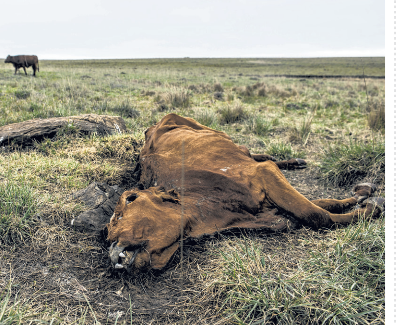
El Nino can cause droughts as well as floods, both of which have an adverse impact on agriculture. It can also affect livestock production, owing to shortages of feed. This threatens food security in many developing nations.