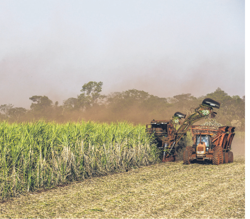
Heavy rains have hurt production of minerals such as iron ore, copper and nickel in countries like Brazil and Chile. Production of commodities like sugar in Brazil has also been affected by heavy rainfall. But a shortage of rainfall has hurt the production of coffee in Vietnam and palm oil in Malaysia.