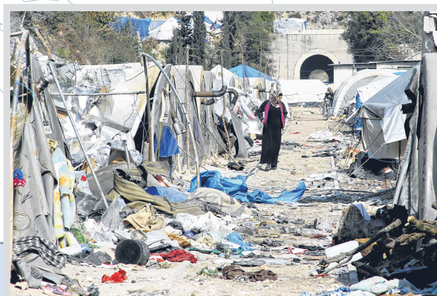
A woman inspecting the damage at a camp for internally displaced people that was hit by shelling in Latakia on Sunday.