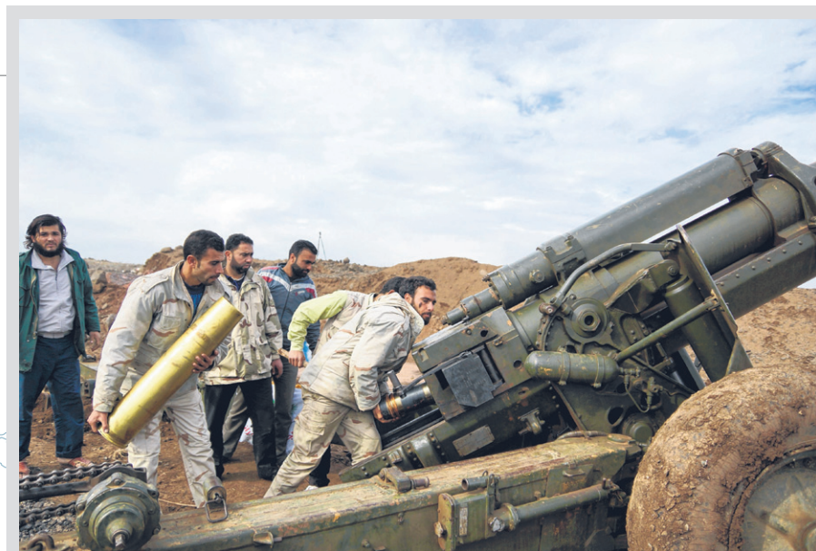
Western-backed Free Syrian Army fighters preparing to launch a shell towards forces loyal to the Syrian government in Deraa on Jan 11.