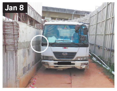
A construction worker was crushed when a truck rolled and trapped him against a wall.