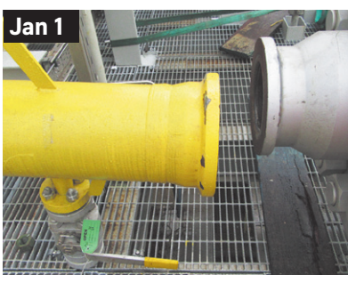
A marine worker died while trying to repair a leaky pipe. The pipe suddenly burst, hitting him.