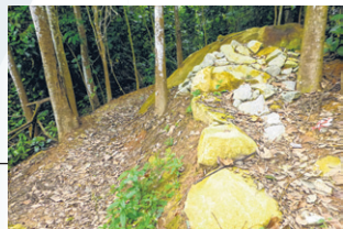
Over the Moon (extremely difficult)