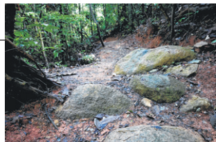
Rocky Arc (moderately difficult)