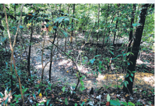
Coconut Berms (moderately difficult)

Mountain biking trail (1.6km) Hiking trail (2.1km) Shelter