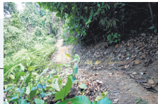
Downhill Rush (moderately difficult)