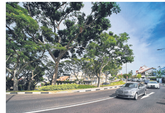
Siglap, Frankel Estate and Opera Estate