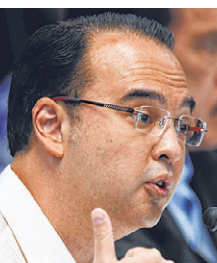
Alan Peter Cayetano