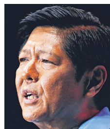
Ferdinand Marcos Jr.