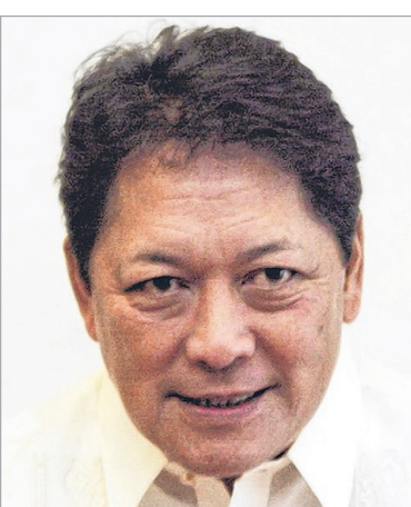
Mr Silvestre Bello , Labour He was justice minister under former presidents Corazon Aquino and Fidel Ramos.