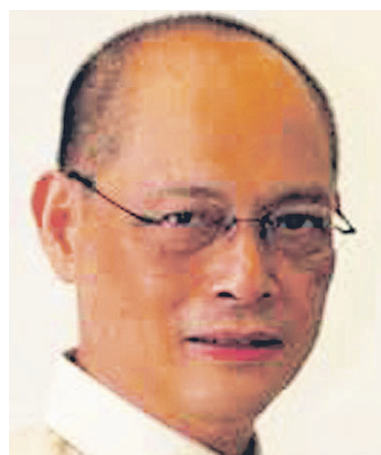
Mr Benjamin Diokno , Budget An economist, he was budget minister under former president Joseph Estrada.