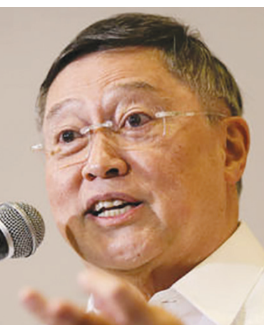
Mr Carlos Dominguez , Finance He was former president Corazon Aquino's agriculture minister. He used to be chief executive of flag carrier Philippine Airlines. A childhood friend of Mr Duterte's, he owns one of Davao city's biggest hotels.

Philippine President-elect Rodrigo Duterte has named a Cabinet made up of close friends, former classmates, leftists and academics. His choices of economic managers have won praise, and Mr Duterte describes them all as "men of integrity and honesty".