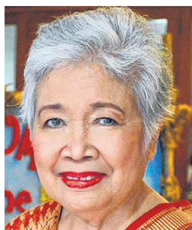
Ms Leonor Briones , Education She was national treasurer under former president Joseph Estrada. She is a professor emerita at state-run University of the Philippines (UP).