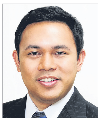
Mr Mark Villar , Public Works and Highways He is a congressman. His family owns the Philippines' biggest mass housing developer.