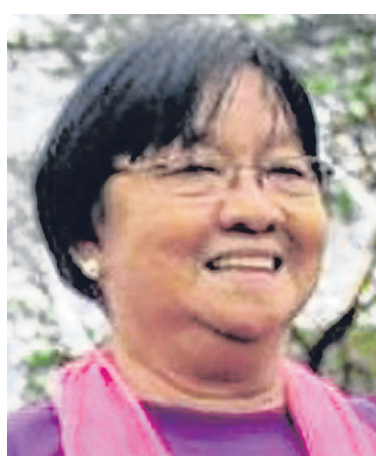
Ms Judy Taguiwalo , Social Welfare A political prisoner under the Marcos regime, she is a women's rights advocate and currently a UP professor. She was in a list submitted by Mr Duterte's communist allies.