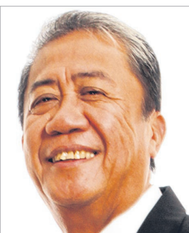
Mr Arthur Tugade , Transportation and Communication A classmate of Mr Duterte's in law school, Mr Tugade was head of Clark Development Corp.