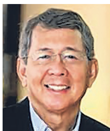
Mr Perfecto Yasay , Foreign The former head of the Securities and Exchange Commission, his testimony on a massive stock scandal helped build a case that led to the impeachment of former president Joseph Estrada.