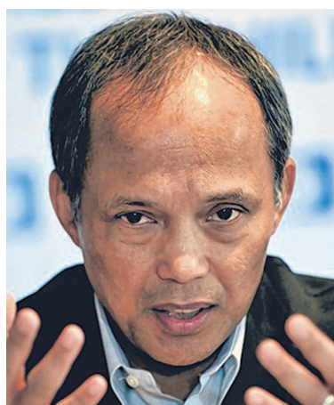
Mr Alfonso Cusi , Energy A technocrat, he headed the Manila International Airport Authority, Philippine Ports Authority, and Civil Aviation Authority of the Philippines under former president Gloria Arroyo.