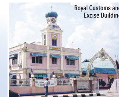
Royal Customs and Excise Building