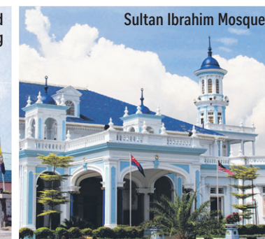
Sultan Ibrahim Mosque