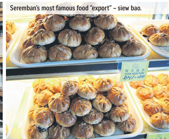
Seremban's most famous food "export" – siew bao.