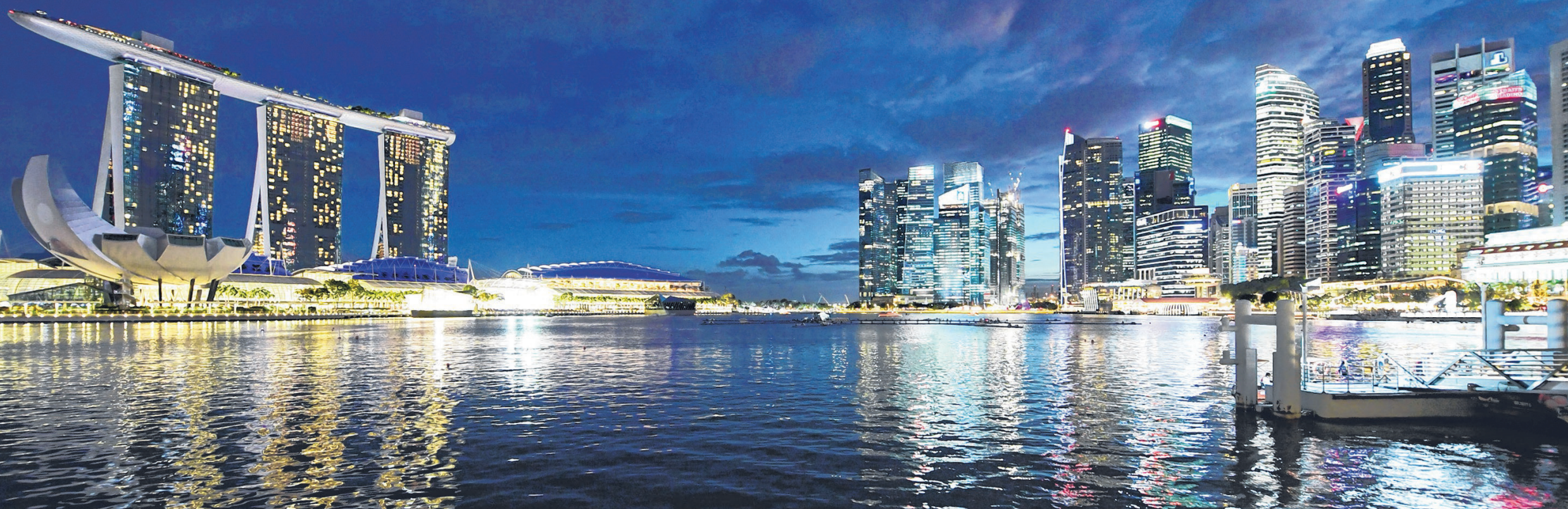
The countdown at Marina Bay will feature an eight-minute fireworks display, integrated for the first time with light, laser and flames.

There's no containing this year's celebrations, with the massive Marina Bay festivities spilling over into the Civic District for the first time, and the raucous Siloso Beach Party marking its 10th year. Bringing the party to the people are the People's Association grassroots organisations, with over 200 heartland countdowns islandwide.