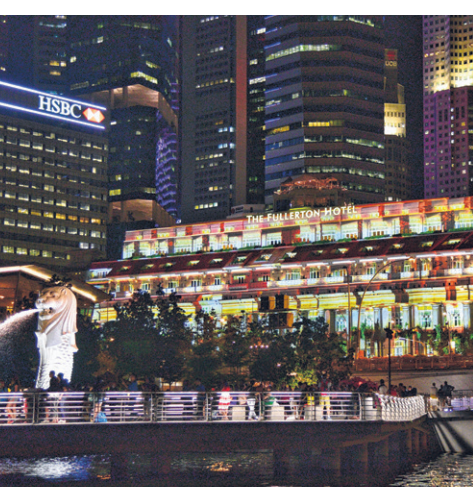
The facade of the Fullerton Hotel will be lit up with a dazzling five-minute display every hour from 8pm to 11pm tonight.

From sunset yoga to local artisan crafts, movie screenings to a star-studded rock concert, there's something for everyone at Singapore's largest countdown party. The facade of the Fullerton Hotel will be lit up with a dazzling five-minute display every hour from 8pm to 11pm, followed by fireworks amid a minute-long light, laser and fire show in the centre of the bay.