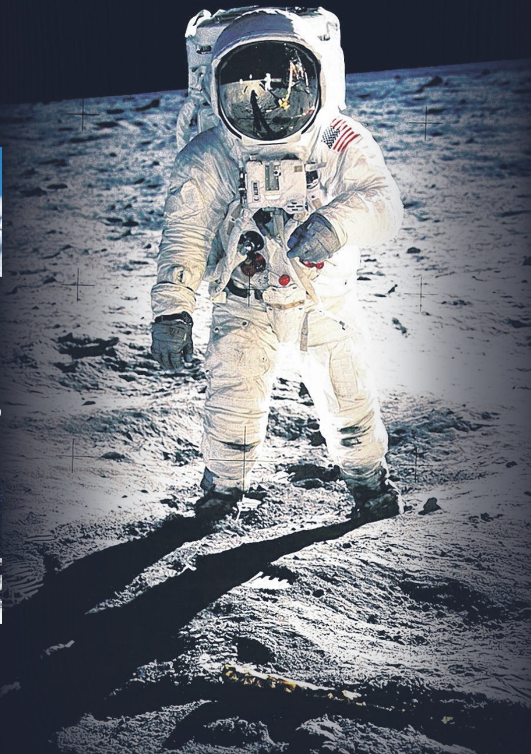
Apollo 11 astronaut Edwin Aldrin on the surface of the Moon as taken by fellow astronaut and the first man on the Moon, Neil Armstrong.