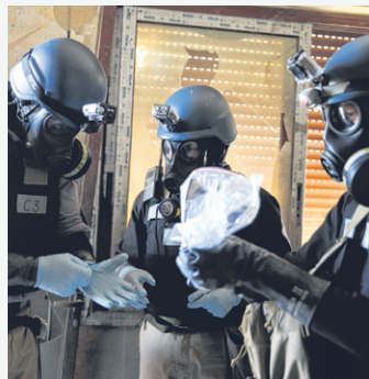
A UN chemical weapons expert with samples retrieved from one of the sites of an alleged chemical weapons attack in Damascus, Syria, in August 2013.

• Japan's doomsday cult Aum Shinrikyo used VX injections in assassination attempts on enemies in 1994 and 1995; one person died. It used another nerve agent – sarin – in a March 1995 attack on the Tokyo subway, killing 12 people.