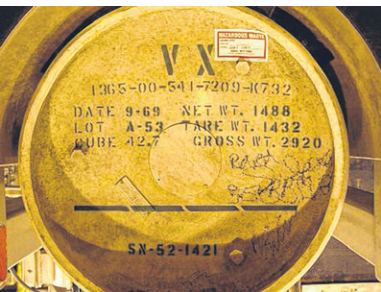
VX nerve agent stored in a container.