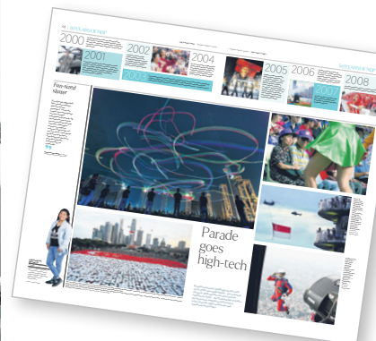
ILLUSTRATION OF THE YEAR

Fraemone Wee for her layout / page design "50 parades. In photos" (ST)