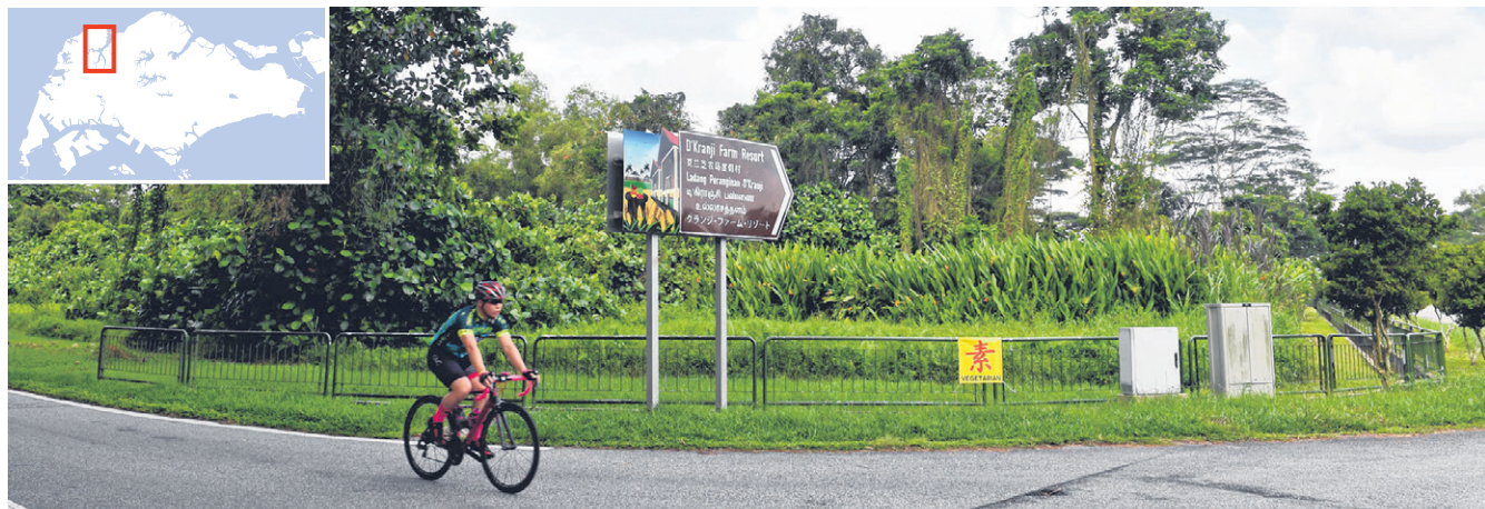
Three plots of land for food-fish cultivation at the junction of Neo Tiew Road and Neo Tiew Crescent will be up for tender in October.