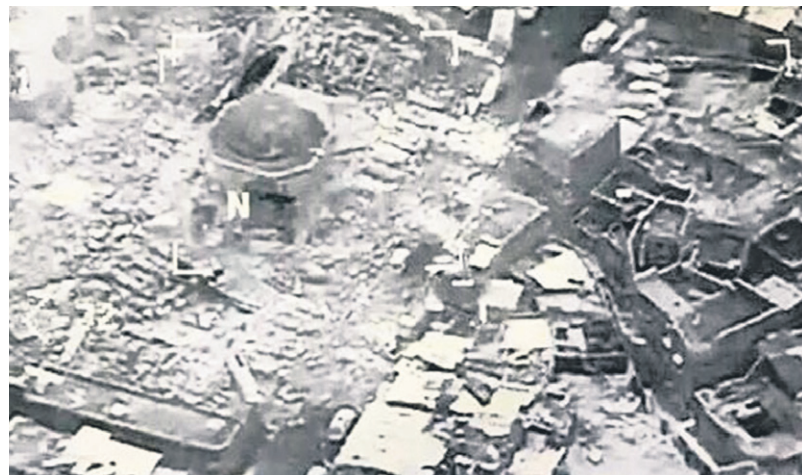
An image taken from a video of the destroyed mosque.