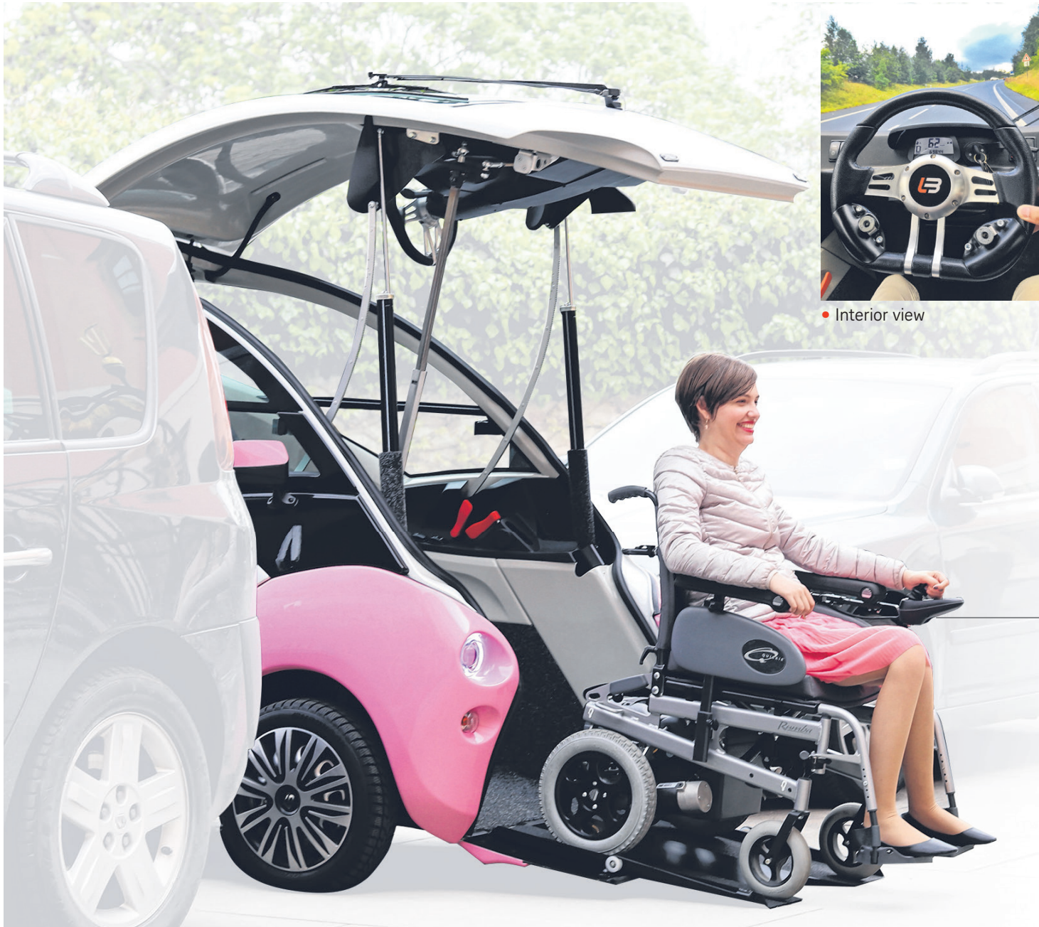
• Interior view

Those who have lost the use of their legs do not have to be rendered immobile – many can and do drive. Yet, current options for wheelchair users are not wholly satisfactory, as most are ordinary vehicles modified to be wheelchair-accessible. Now, a family from the Czech Republic has designed a car that allows the front to be opened so that drivers can park facing the pavement, open the door and wheel right out safely.