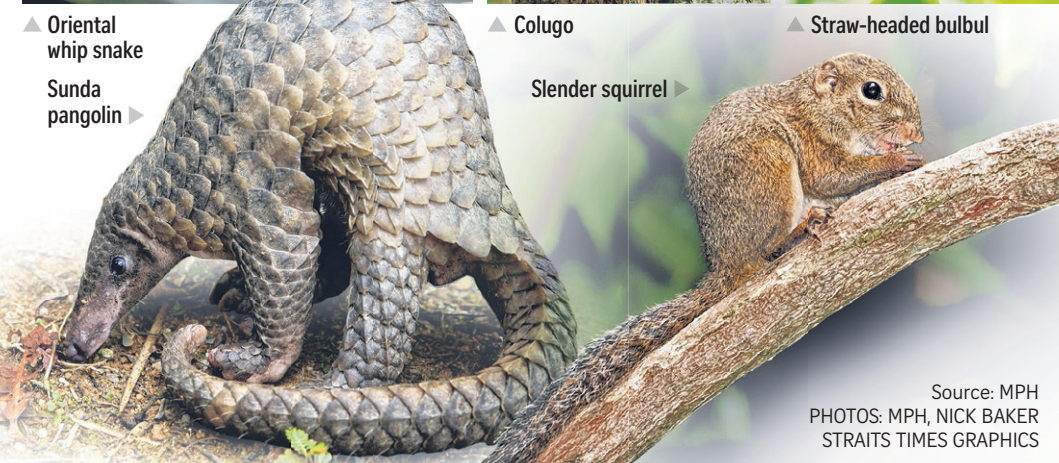
Slender squirrel ▶