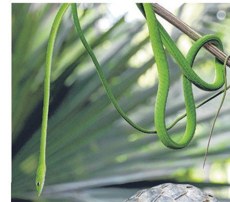
▲ Oriental whip snake Sunda pangolin ▶