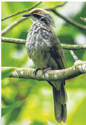
▲ Straw-headed bulbul