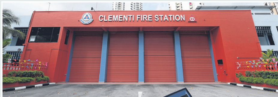
Above: Clementi Fire Station's cladding has been removed