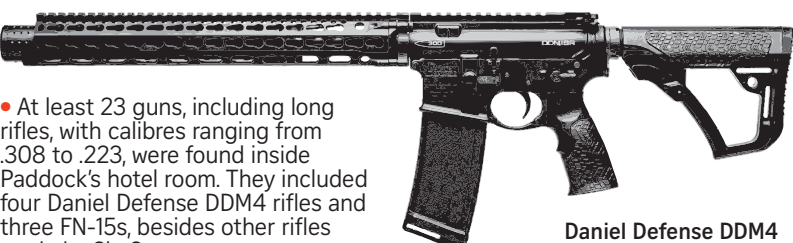
Daniel Defense DDM4