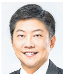
Ng Chee Meng (2015): Minister in the Prime Minister's Office and labour chief designate