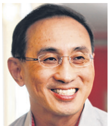
Desmond Kuek (2010): SMRT chief executive, leaving Aug 1