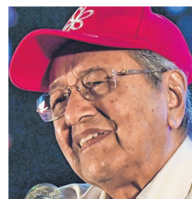
Tun Dr Mahathir Mohamad