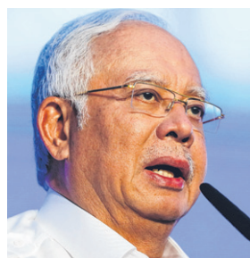
Prime Minister Najib Razak

They will be choosing their Members of Parliament and state assemblymen. Sarawak, which held its state assembly elections in 2016, will only be choosing its MPs.