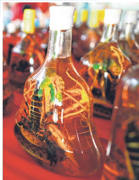
Bottles of snakes and scorpions soaked in alcohol being sold in a stall in Don Sao island, Laos.