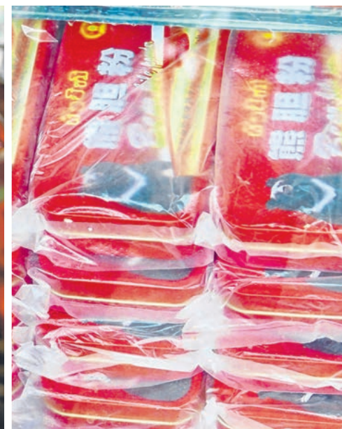
Medicines containing exotic wildlife and their parts in Boten, Laos.