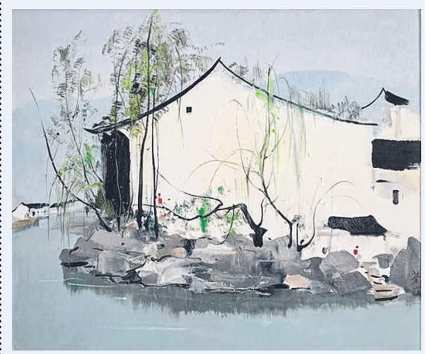
Riverside Households (1985) by Wu Guanzhong.