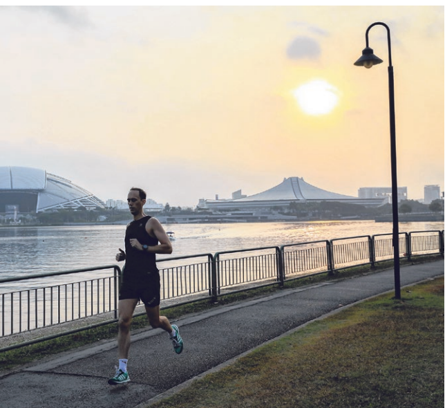
Part of the ST Run route will take participants past the waterfront at Tanjong Rhu, with the National Stadium and Singapore Indoor Stadium as the backdrop.