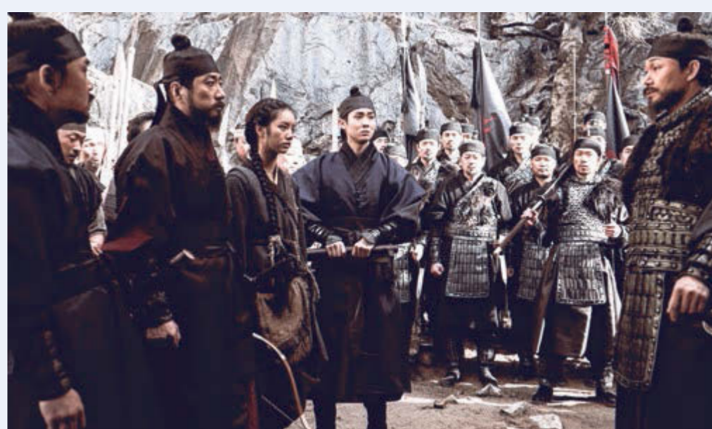
(From far left) Kim In-kwon, Kim Myung-min, Lee Hye-ri, Choi Woo-shik and Park Sung-woong star in Monstrum.