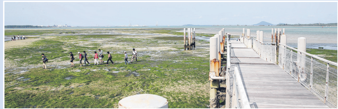
Intertidal walk at Chek Jawa.

Inclusion of information about marine habitats in school curriculum