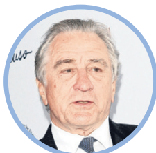
Robert De Niro

• The first bomb is detected in a package sent to the home of billionaire activist George Soros.