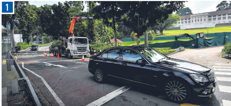
1 Above: Canning Rise before the National Museum of Singapore's coach drop-off bay. In the background on the far right is the iconic Fort Canning Arts Centre.