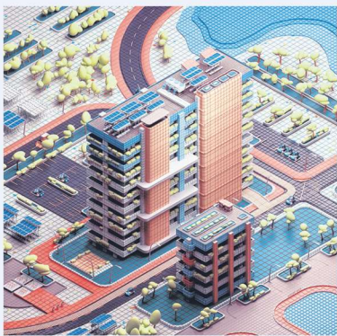
PHOTOS: CHAN + HORI CONTEMPORARY; LIGHT SINGAPORE, MULAN GALLERY; NANYANG ACADEMY OF FINE ARTS