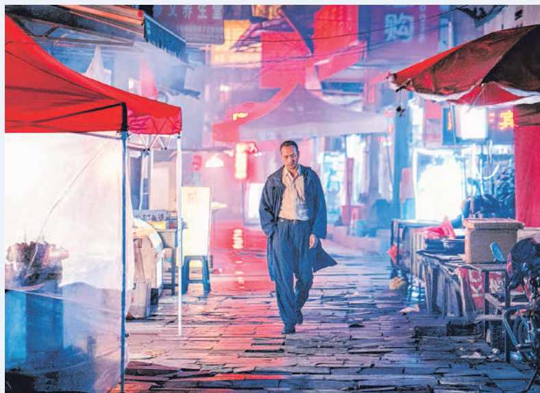
PHOTOS: HAPPINESS FILM FESTIVAL, SINGAPORE FILM SOCIETY, NUS ARTS FESTIVAL