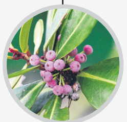
Kicar-kicar ( Rapanea porteriana )