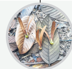
Meranti tembaga ( Shorea leprosula )