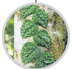
Satin pothos ( Scindapsus pictus )