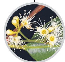
Kelat hitam ( Syzygium syzygioides )