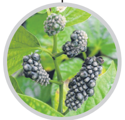
Wild pepper ( Piper sarmentosum )