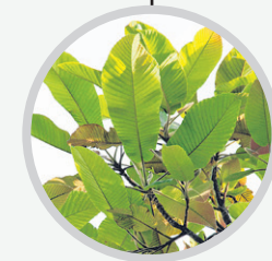
Simpoh gajah/ Stilted simpoh ( Dillenia reticulata )