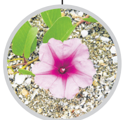
Beach morning glory ( Ipomoea pes-caprae )