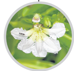
Sea lettuce tree ( Scaevola taccada )