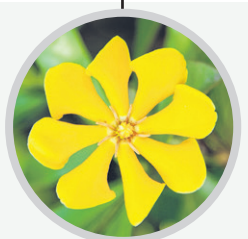
Delima hutan ( Gardenia tubifera )