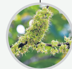
Nyatoh puteh/ White gutta ( Palaquium obovatum )