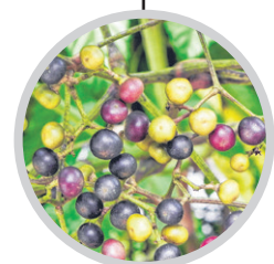
Jolok-jolok/ Common tree-vine ( Leea indica )