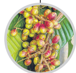
Island lychee ( Pometia pinnata )