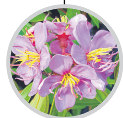
Singapore rhododendron ( Melastoma malabathricum )