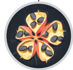
Kelumpang burong/Common sterculia ( Sterculia parviflora )