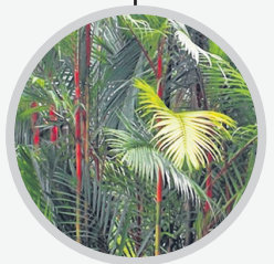
Lipstick palm ( Cyrtostachys renda )