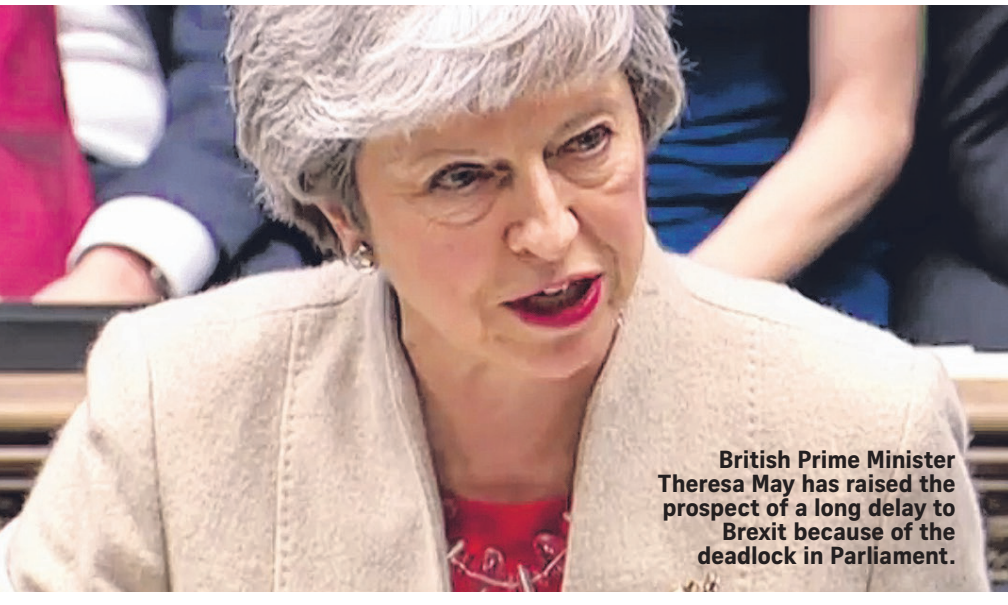
British Prime Minister Theresa May has raised the prospect of a long delay to Brexit because of the deadlock in Parliament.