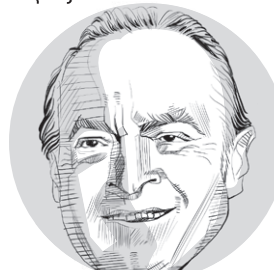
Bob Hope American comedian, actor, dancer, athlete, author.

Some of the famous people who have been named honorary Globetrotters. Funnily enough, only one is a certified basketball player.