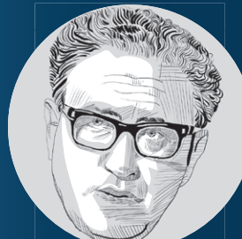
Henry Kissinger Nobel Peace Prize-winning diplomat, US Secretary of State.