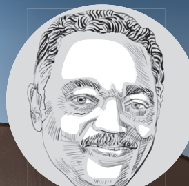
Jesse Jackson American civil rights activist, Baptist minister, politician.