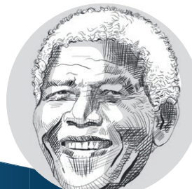
Nelson Mandela South Africa's anti-apartheid hero and its first black president.