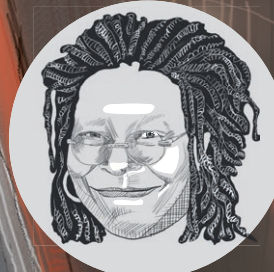
Whoopi Goldberg American actress, comedian, author, television host.