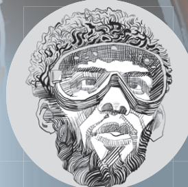
Kareem Abdul-Jabbar US basketball legend who played 20 seasons in the NBA.