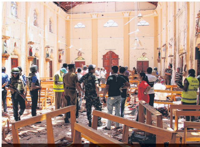
Sri Lankan security personnel at the scene following an explosion in St Sebastian's Church in Negombo.