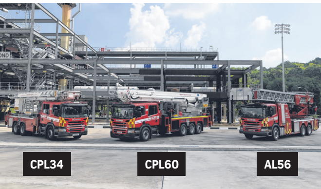
The Combined Platform Ladder 34m (CPL34), the Combined Platform Ladder 60m (CPL60) and the Aerial Ladder 56m (AL56).

The Combined Platform Ladder 60m (CPL60) can extend to a height of a 20-storey building, and is equipped with a water monitor and a rescue cage that can hold up to 500kg. It was one of the SCDF's new capabilities to meet future challenges, on show at its annual workplan seminar.