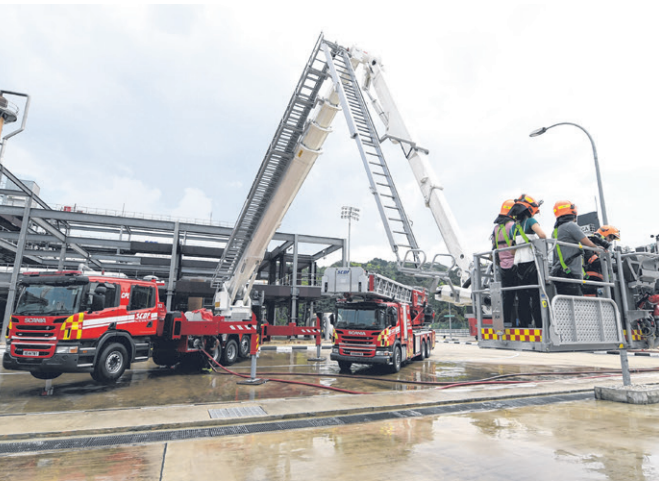
An SCDF officer operates the control station in the CPL60's rescue cage, starting the ladder's upright extension. Pillar extensions prop the fire engine off the ground for greater stability.