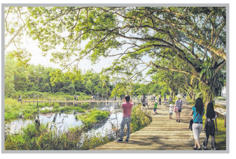
The rustic charm of the existing wetland at Hamilton Place will be enhanced to form a park for recreation and the enjoyment of nature.