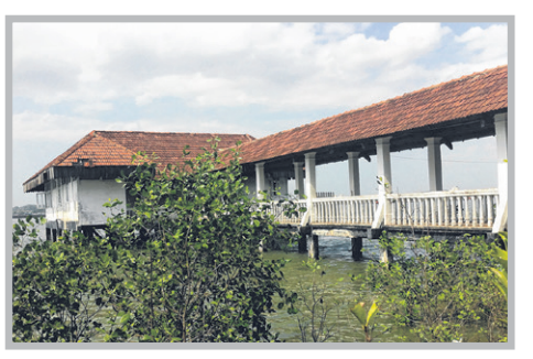
Built in the late 1910s by prominent landowner Joseph Cashin, Cashin House is one of the sites where the Japanese Imperial Army first landed on Feb 8. 1942 during World War II. The house will have a few amenities for visitors to enjoy.