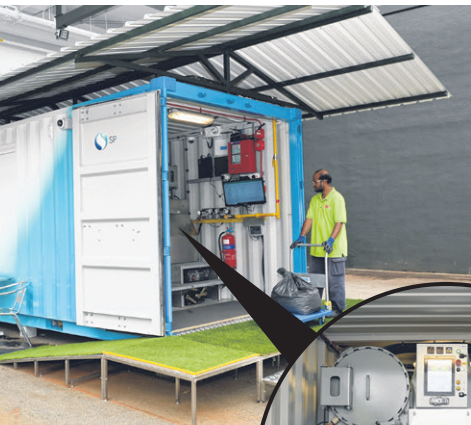
A worker from Gardens by the Bay wheeling a bag of waste to a compact gasification system housed in a 20-foot container.

SP Group's system converts waste collected from Gardens by the Bay into heat and a solid by-product containing carbon.