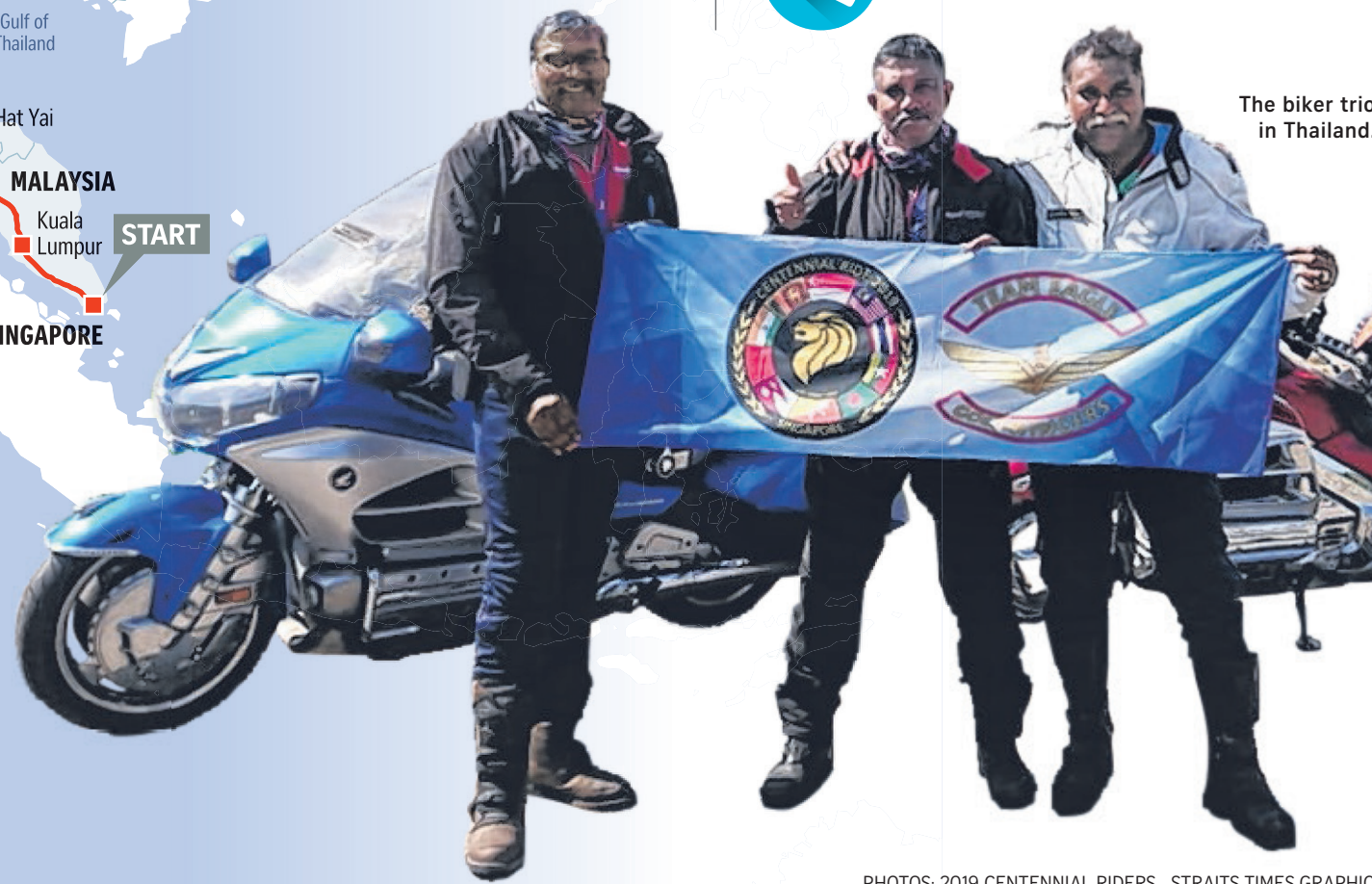
The biker trio in Thailand.