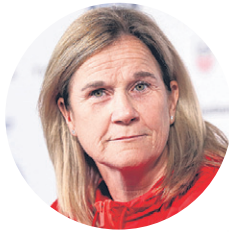
Coach Jill Ellis