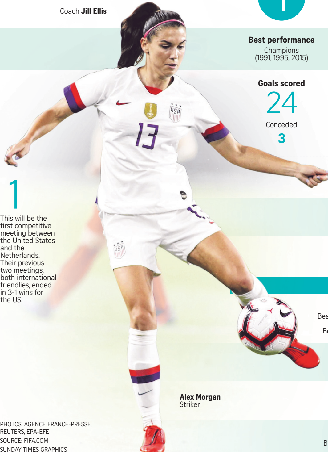
Alex Morgan Striker