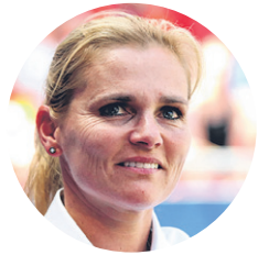
Coach Sarina Wiegman