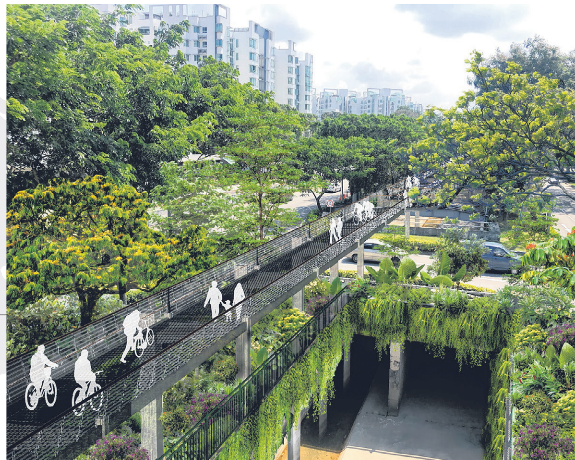
A 1.4km elevated linear park will run above the canal between Bukit Timah and Dunearn roads.