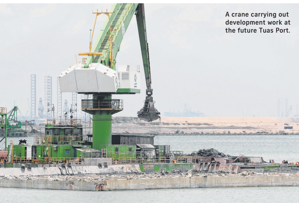
A crane carrying out development work at the future Tuas Port.

PSA's three city terminals at Tanjong Pagar, Keppel and Brani will move to Tuas by 2027, with Pasir Panjang Terminals set to join them by 2040.